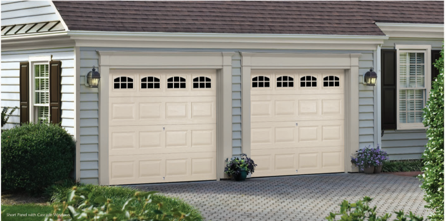
Short Panel with Cascade Windows

When it comes to ultimate protection, the Olympus stands tall. With triple-layer construction, a thermal seal, and superior insulation R-value of 19.40 or 14.46, these durable, low-maintenance doors give you the ultimate in quiet operation and energy efficiency.